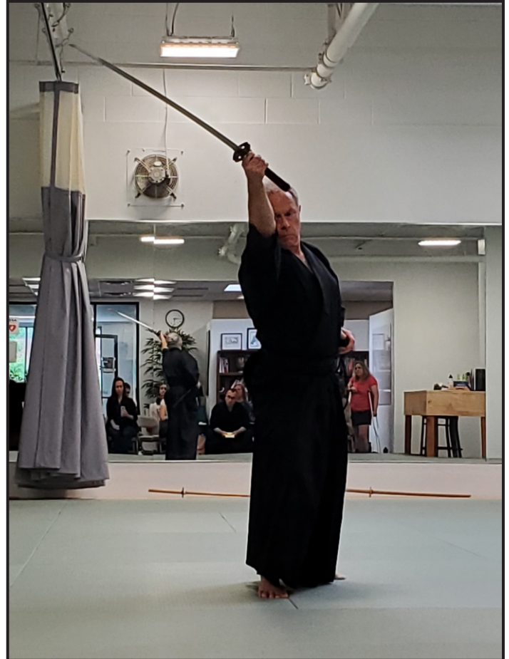
For my individual demonstration, I chose the waza Shinobu (Loyal Retainer).

After the formal announcement of results and promotions, we had a 10-minute break to change uniforms and get back onto the mat for the jujutsu exam. Although only Itten Dojo members would be testing, five of the JMAC jujutsu black-belts joined in to serve as our uke