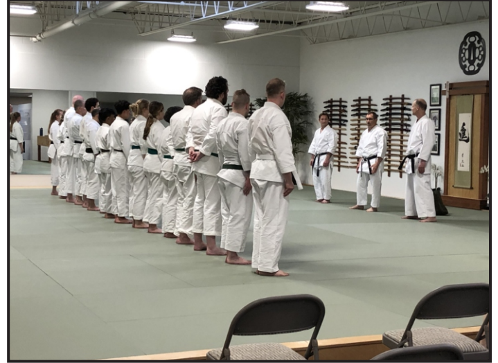
The adults displayed an exceptional degree of skill, especially in their presentations of kata.